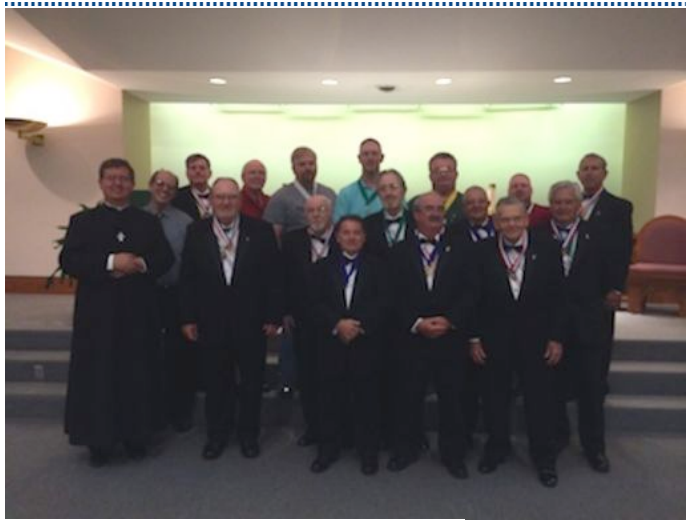
Council 14471 Officer Installation